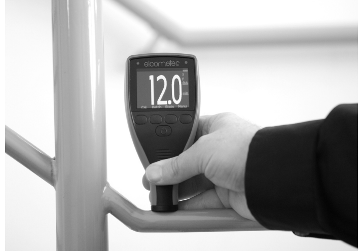
Above: Elcometer Type II Dry Film Thickness Gauge

Dry film thickness may be measured on ferrous metals using a magnetic gauge following the procedure outlined in SSPC-PA2, Section IV, Paint Thickness Measurement. Readings should be taken in accordance with the specification or applicable standards such as those mentioned above.